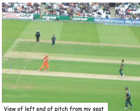
View of left end of pitch from my seat

Not only did I have a comfortable seat, excellent view and sociable company all day, I learnt a lot about the workings of the scorebox in such tournaments and was surprised just how much control the media have over proceedings. It was a brilliant scoring experience and all the better for being unexpected.