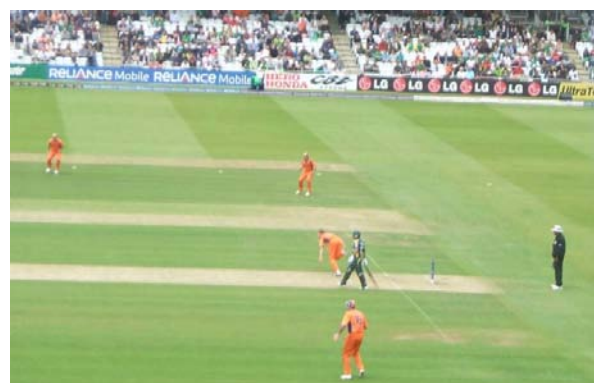
View of right end of pitch from my seat